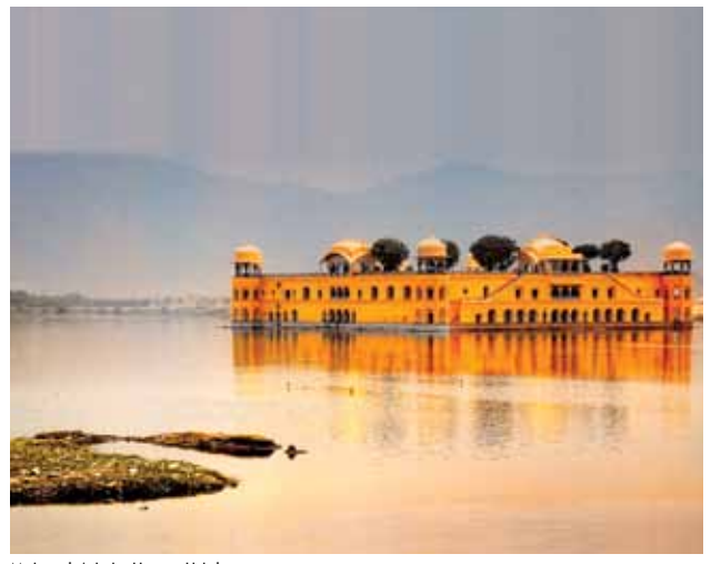
Maharaja's Lake House, Udaipur

sense of awe and curiosity is aroused when one talks about India – fabled for its culture, history and artistic magnificence. India has never failed to impress, and would make a great destination for Valentine's Day.